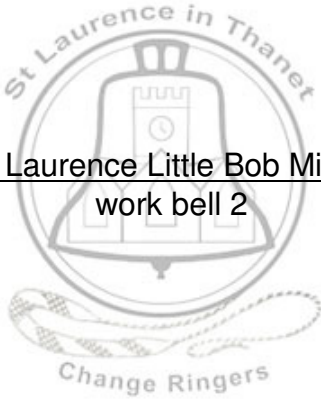
St Laurence Little Bob Minor work bell 2