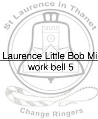
St Laurence Little Bob Minor work bell 5