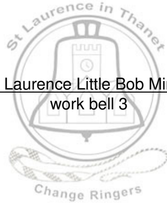
St Laurence Little Bob Minor work bell 3