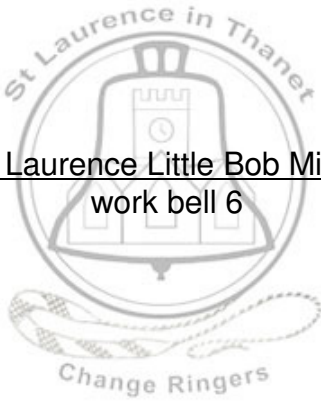
St Laurence Little Bob Minor work bell 6