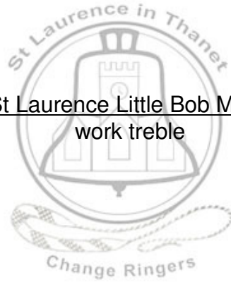
St Laurence Little Bob Minor work treble