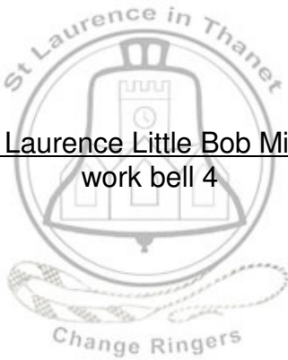
St Laurence Little Bob Minor work bell 4